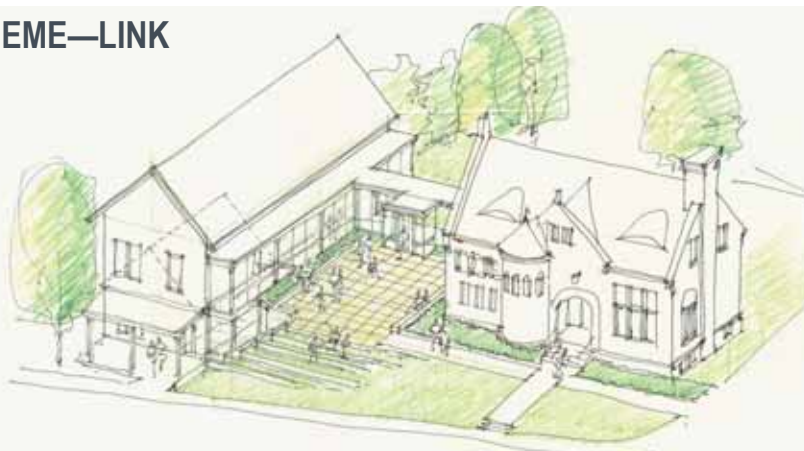
Jeudevine Memorial Library July 2016