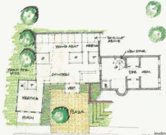
Jeudevine Memorial Library Scale 1"=10' July 2016 "No-Touch Underground Scheme" Lower Level