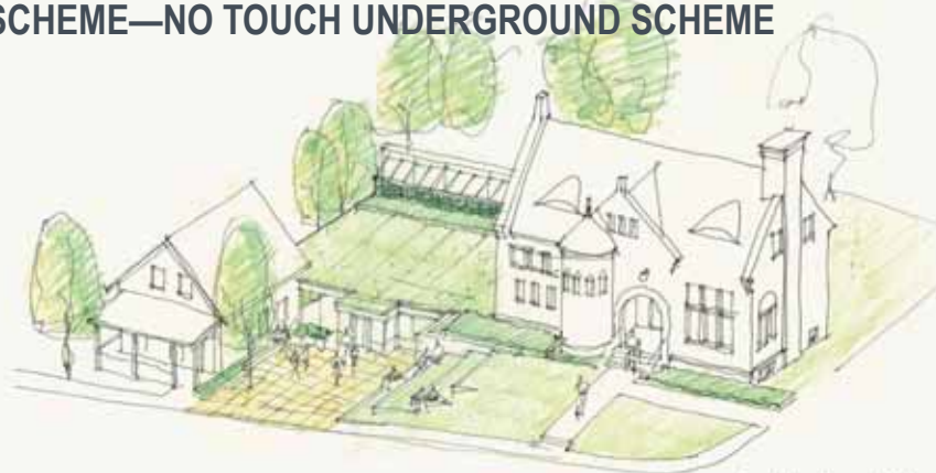
Jeudevine Memorial Library July 2016 "No Touch Underground Scheme"